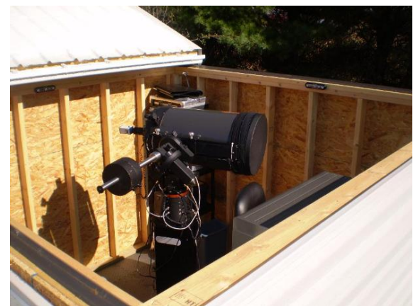
Left: Observatory construction nearly complete. Above: C-14 inside Willow Oak Observatory.