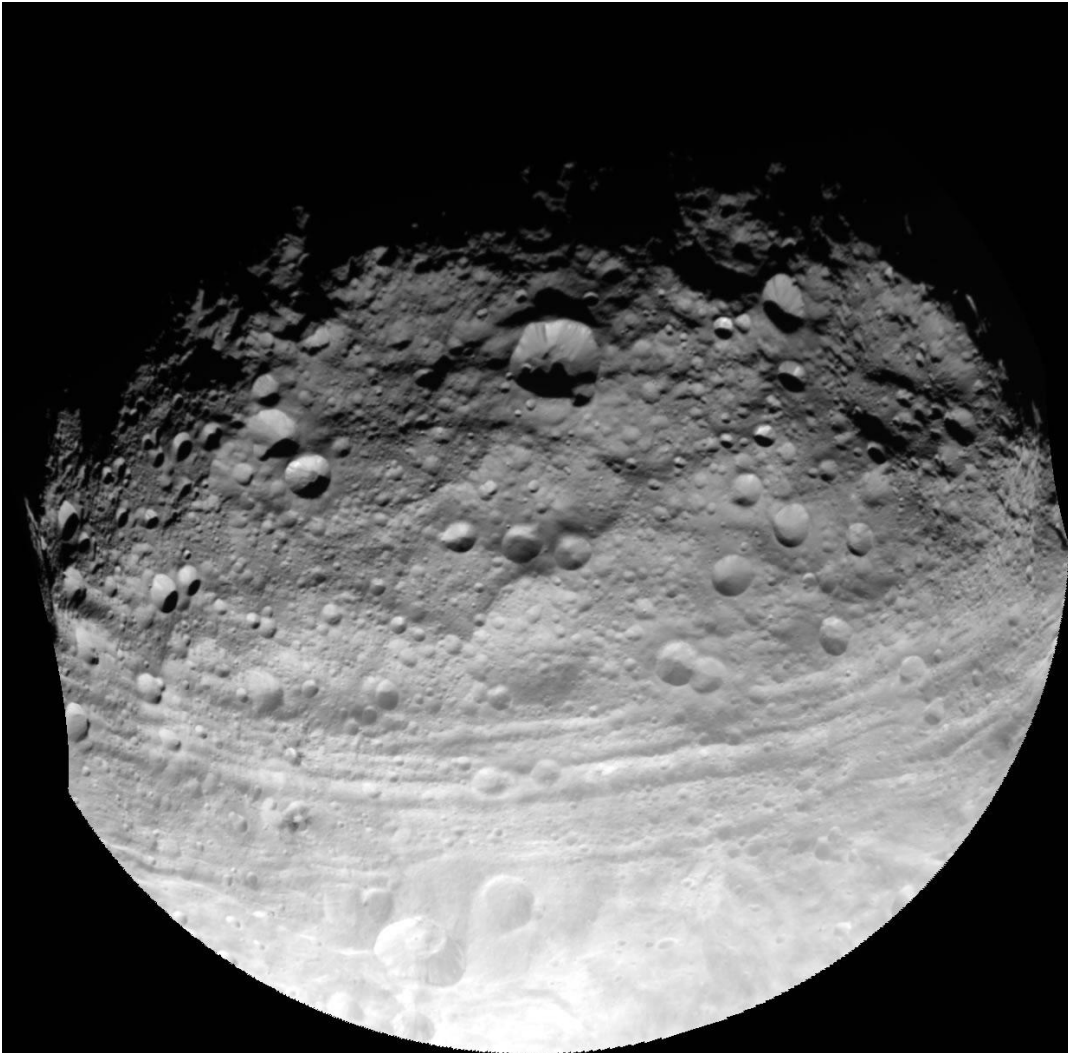
This full view of the giant asteroid Vesta was taken by NASA's Dawn spacecraft, as part of a rotation characterization sequence on July 24, 2011, at a distance of 5,200 kilometers (3,200 miles).

This article was provided by the Jet Propulsion Laboratory, California Institute of Technology, under a contract with the National Aeronautics and Space Administration.