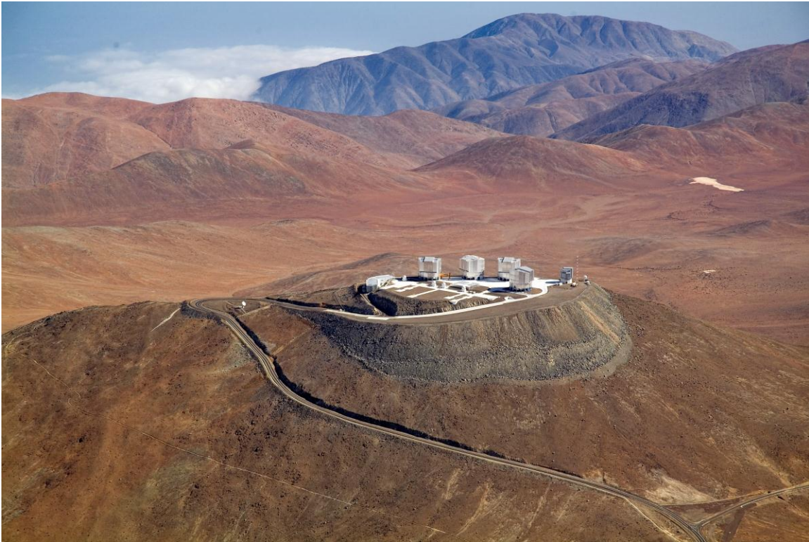
European Southern Observatory at Mt. Paranal, Chile