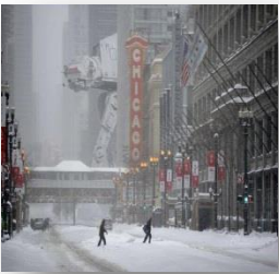
Chicago weather during the conference....

Come Join me at the next club meeting to find out what a Heliophysics Educator Ambassador is, where they work, how you can become one too, and when the world will end (just checking to see if your still reading). I will give a short (OK maybe a little longer than short, OK, OK, a lot longer than short) talk about the HEA program, some samples of activities, and how this program can help our club bring in and keep younger members.